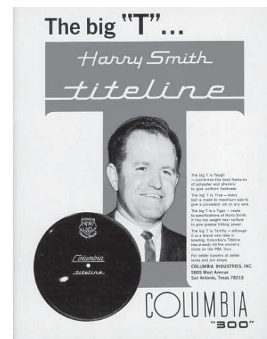
The Big "T" Advertisement from Columbia 300.