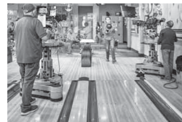
On set taping of Smallwood.

When the series was first posted to cbs.com and the CBS