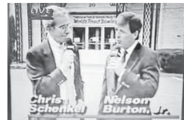
ABC Sports April 27, 1991 Chris Schenkel and Nelson Burton, Jr.

Among the usual recent ads for Kia, KitKat, KFC, Geico, and Apartments.com were newer advertisers like Can Am Motor Bikes, Xyzal Allergy, Domino's Pizza, Nature's Bounty, and Safelite Auto Glass. That's a pretty diverse group covering pretty wide demographic group