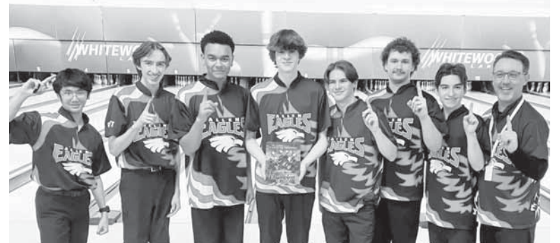
Allen Eagles Boys High School Team - Lubbock