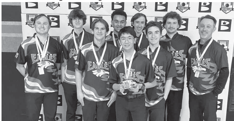
Allen Eagles Boys High School Team - New Braunfels