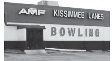
Nestled along 10 Pin Avenue, AMF Kissimmee Lanes is hidden from view along Highway 192, behind a hotel, bakery and restaurant supply. The outside of the building has not changed since it opened more than 45 years ago.