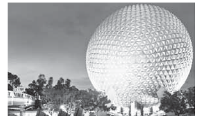
The showcase of the theme park is the impressive Spaceship Earth geosphere (known to locals as the giant golf ball), that leads visitors to the World Showcase Lagoon, surrounded by all the different restaurants.