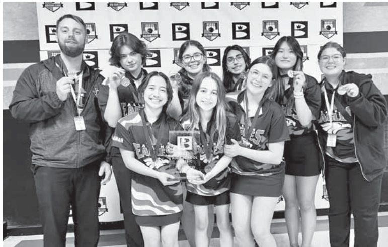
Allen Eagles Girls High School Team - New Braunfels