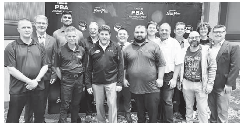
PBA Southwest RPI Players