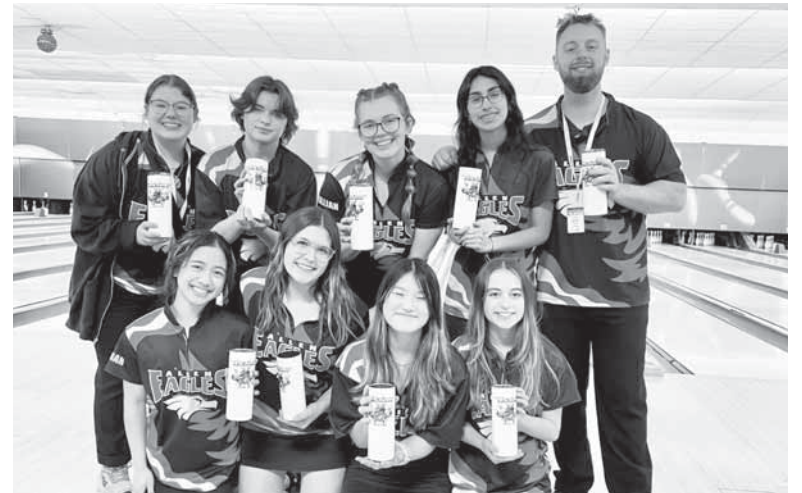
Allen Eagles Girls High School Team - Lubbock